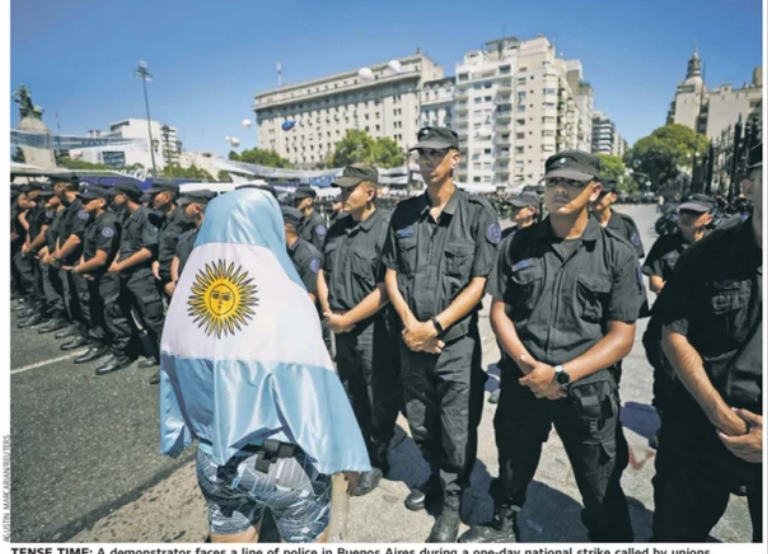
TENSE TIME: A demonstrator faces a line of police in Buenos Aires during a one-day national strike called by unions opposing right-wing President Javier Milei's decree limiting the power of unions and deregulating the economy. A16