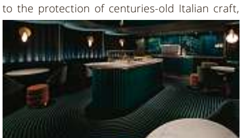
The Peninsula Hong Kong Boutique & Café

Seek unique opportunities to meet artists and artisans to help build your art collection this year. THE PLACE Firenze's philanthropic foundation The Place of Wonders is dedicated